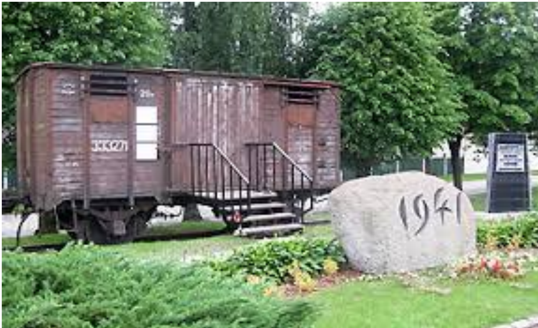
Railroad cattle cars – means of transportation to Siberia