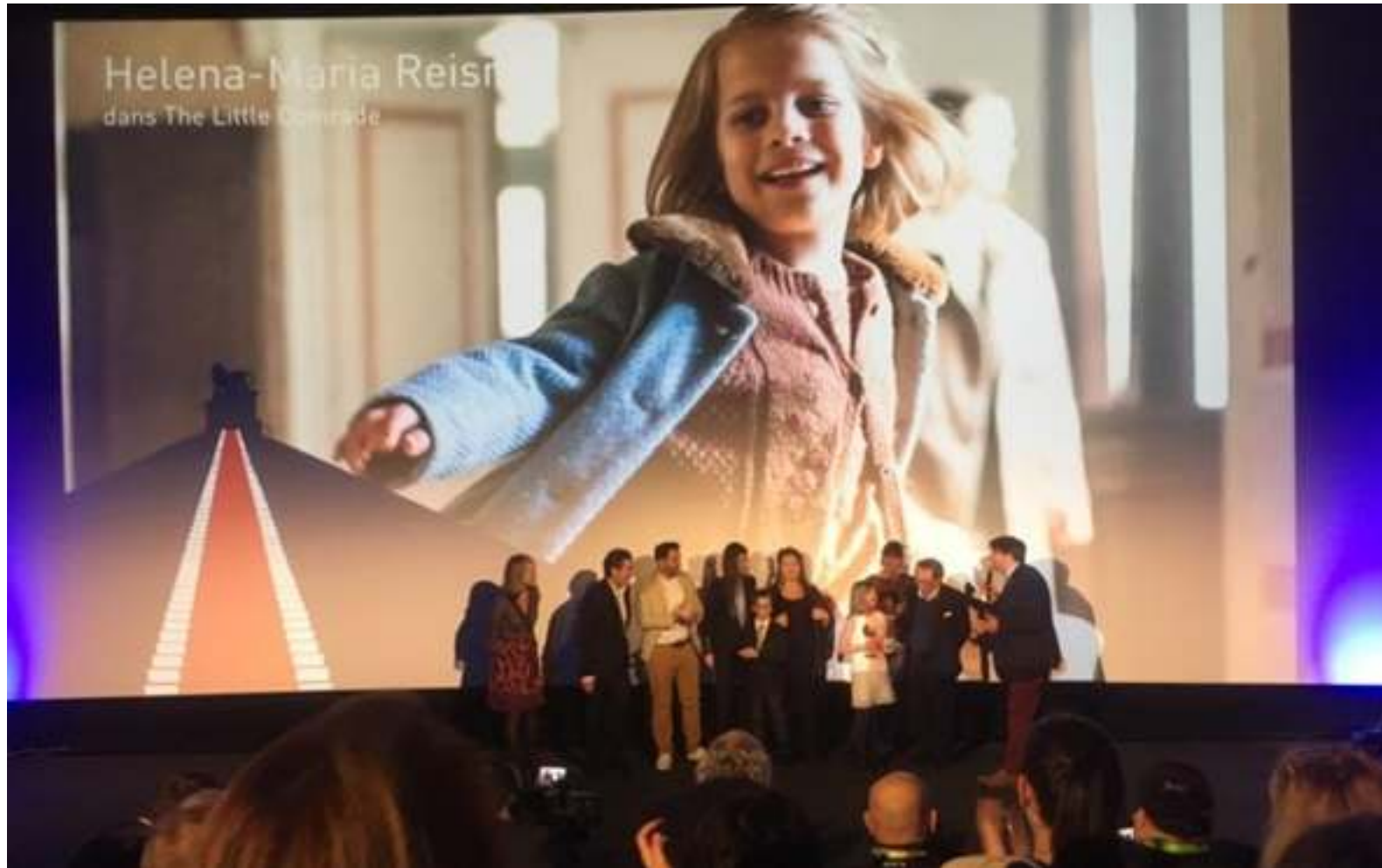
Waterloo Historical Film Festival (Brussels, Belgium), 2018